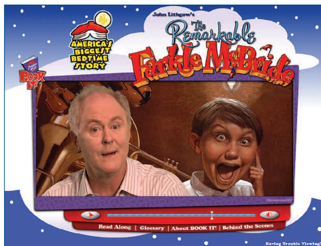
Thomson filmed, edited, produced and hosted the entire presentation, allowing Pizza Hut® to focus its resources on crafting and promoting the campaign.

“We had to find a Web-based platform that would accommodate thousands of simultaneous visitors and, at the same time, be fun and interactive given our audience. Thomson iShowcase was the perfect solution for our needs and gave us the ability to maintain the attitude and tone of the BOOK IT! Program while using the latest technology.”