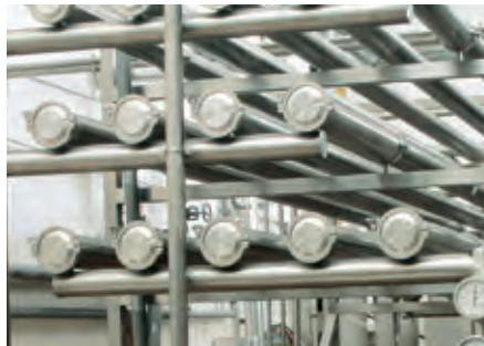
Divos® membrane cleaning