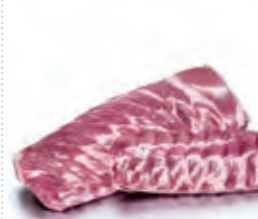
Cryovac® TBG vacuum shrink bags for bone-in products