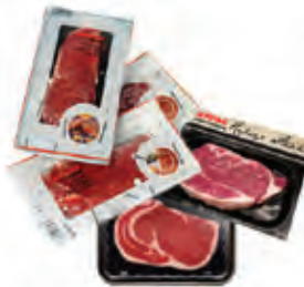
Cryovac® Darfresh® and Cryovac® Mirabella® case ready solutions