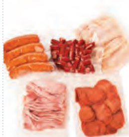
Cryovac® Freshness Plus® odor scavenging solutions