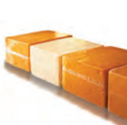
Cryovac® vacuum shrink bags