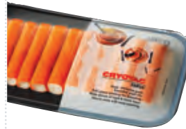
Cryovac® LID Film