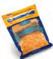
Cryovac® Multi-Seal® FoldLOK easy open/reclose solution