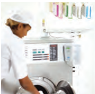
Clax® Revoflow™ laundry dispensing system