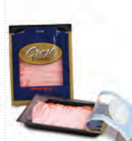
Cryovac® Multi-Seal® easy open/reclose solution