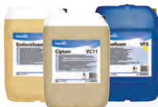
Diversey™ detergents and Divosan® disinfectants