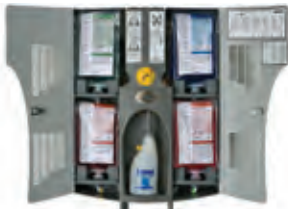
QuattroSelect® dispensing system