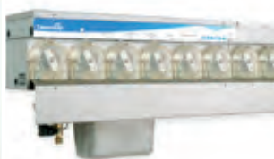
Diverflow™ 2 laundry dispensing system