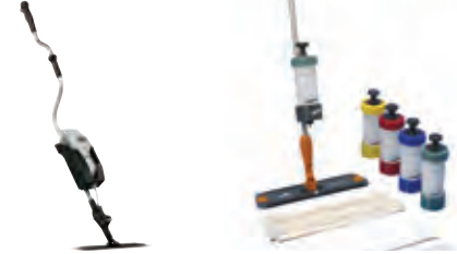
Floor finish applicators and sprayable mops