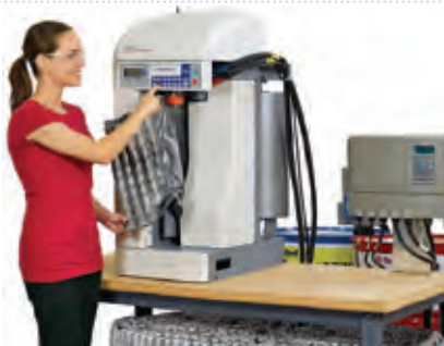
Instapak Complete® system