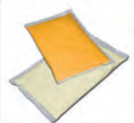
Cryovac® vertical form fill seal for dairy applications