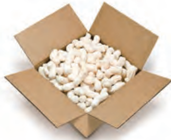
PakNatural™ loose fill