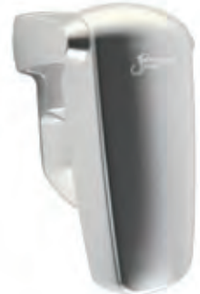
Soft Care® Sensations