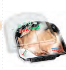
Cryovac® Deli-Snap!™ easy open/reclose solution