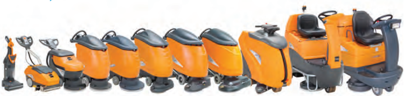
TASKI® Swingo™ Scrubber/Driers