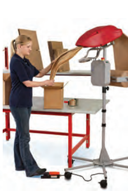
FasFil® EZ™ paper void fill systems