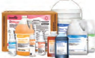
Diversey™ Cleaning and Sanitizing product range