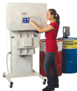
Instapak iMold® automated foam packaging system