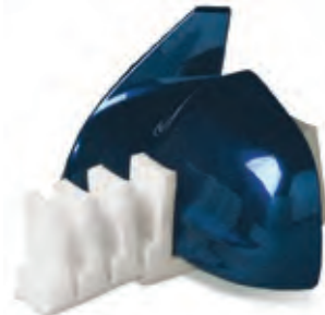
Ethafaam® Synergy® fine cell polyethylene foam