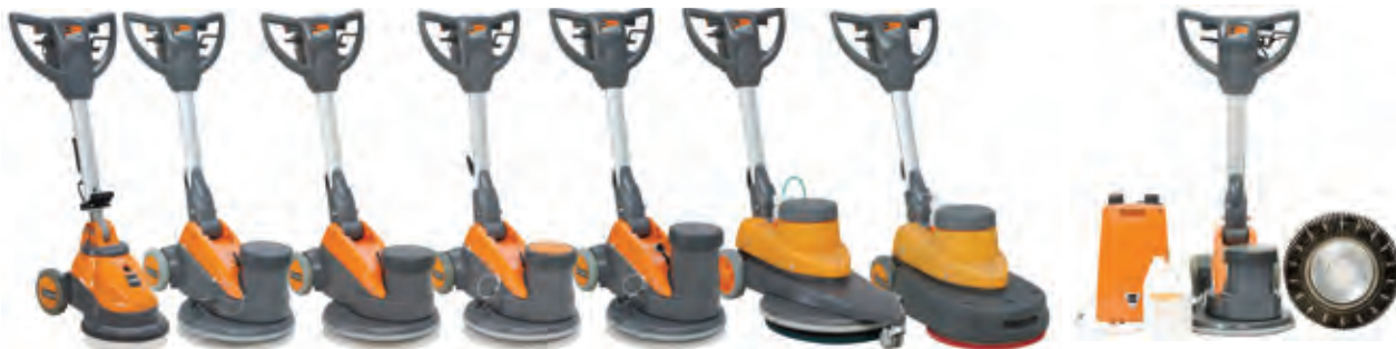
TASKI Ergodisc® single-disc burnishing solutions