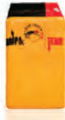
Cryovac® Grip & Tear® bags