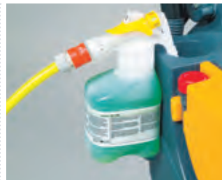
J-Flex™ dispensing system