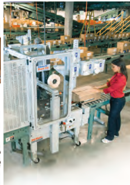
Rapid Fill® automated void fill packaging system