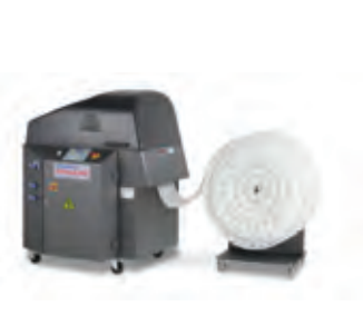
FillTeck™ inflatable cushioning systems