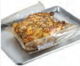
Cryovac® Oven Ease™ solutions