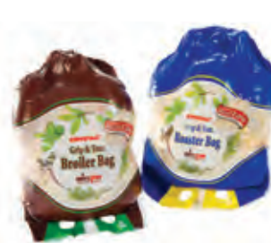
Cryovac® Grip & Tear® bags