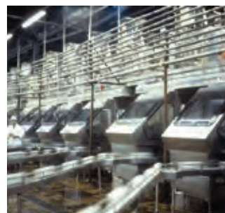
Dry Tech™ lubricant