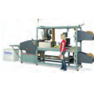
PriorityPak® automated packaging systems