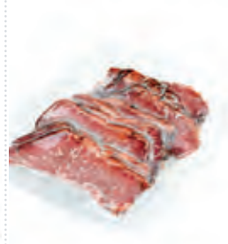
Cryovac® rollstock solutions