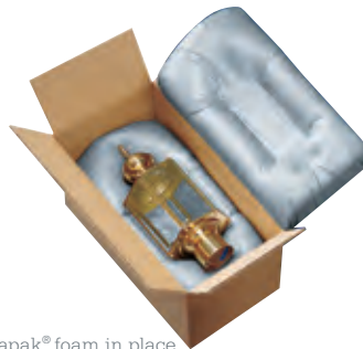
Instapak® foam in place