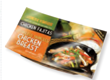
Cryovac® rollstock solutions