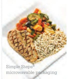
Simple Steps® microwavable packaging