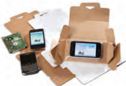
Korrvu® retention packaging