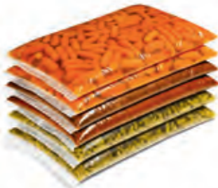
Cryovac® VPP Vertical Pouch Packaging (frozen, chilled and shelf stable packaging)