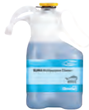
SmartDose™ dispensing system