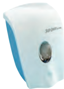
Soft Care® Dispenser