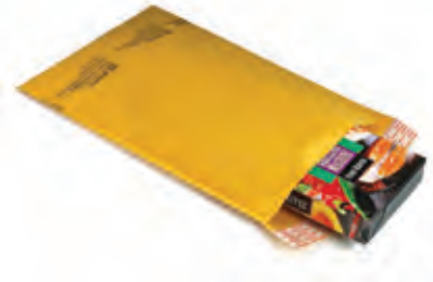
Jiffy Mailer® products