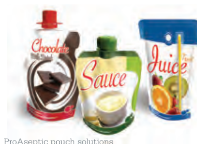
ProAseptic pouch solutions