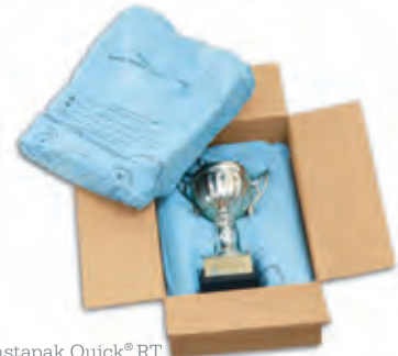
Instapak Quick® RT foam packaging