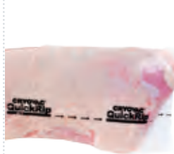
Cryovac® QuickRip™ vacuum shrink bag