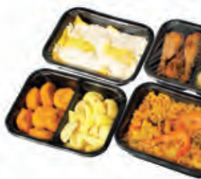
Cryovac® n'Oven Ovenable Foam Tray