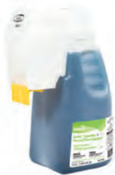
Suma® Optifill™ pan and pot detergent concentrate and portable dosing and dispensing technology