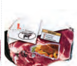
Cryovac® Grip & Tear® bags