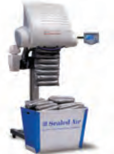
SpeedyPacker® foam-in-bag systems