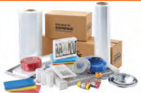
Cryovac® and Opti® shrink film