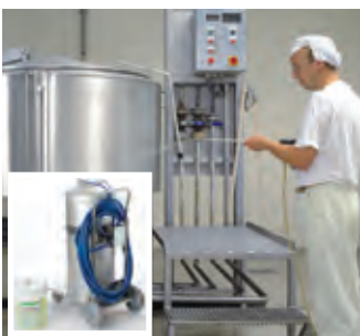
Diverclean™ portable foamer with EnduroChlor™ for open plant cleaning