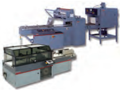
Shanklin® shrink film systems