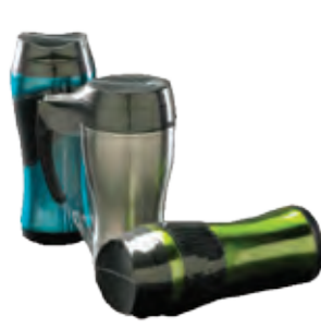
Cryovac CT-301® shrink film