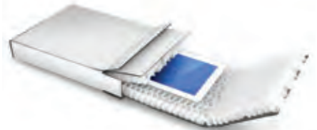
Cellu-Cushion® Excell™ expandable polyethylene foam