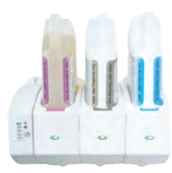
Suma® Revoflow™ washing detergent and dispensing system

Other solutions include: degreasers, sanitizers, and oven grill cleaners