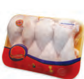
Cryovac® SES oxygen permeable stretch-shrink poultry farms