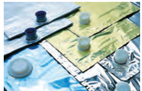
Entapack® IBC liners and bag-in-box solutions