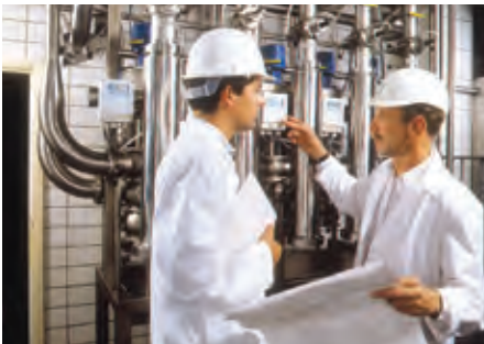
Diverflow® clean in place systems