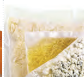
Cryovac® rollstock solutions