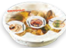
Cryovac® BDF® Soft