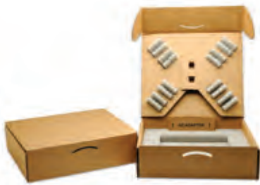
Ethafaam® MRC recycled content polyethylene foam