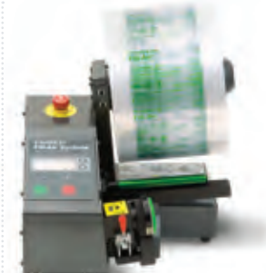
Fill-Air® inflatable packaging system