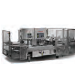
Cryovac® vacuum shrink systems