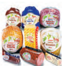
Cryovac® Grip & Tear® bags