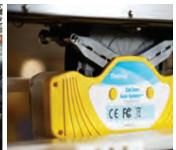
ZipClean™ conveyor belt cleaning