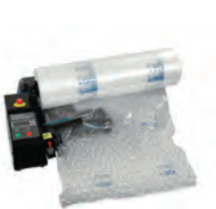
NewAir I.B.® systems