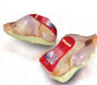
Cryovac® BDF® for Whole Birds