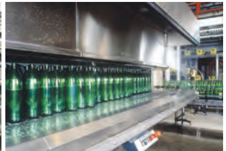
Divobrite® system bottle washing & Dicolube® track treatment