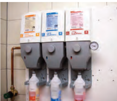
Diverflow® dispensing system for detergents