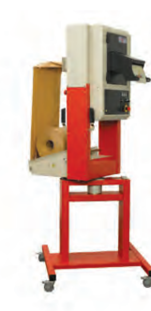
PackTiger® paper packaging systems