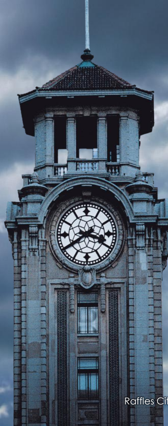
Raffles City Shanghai, China