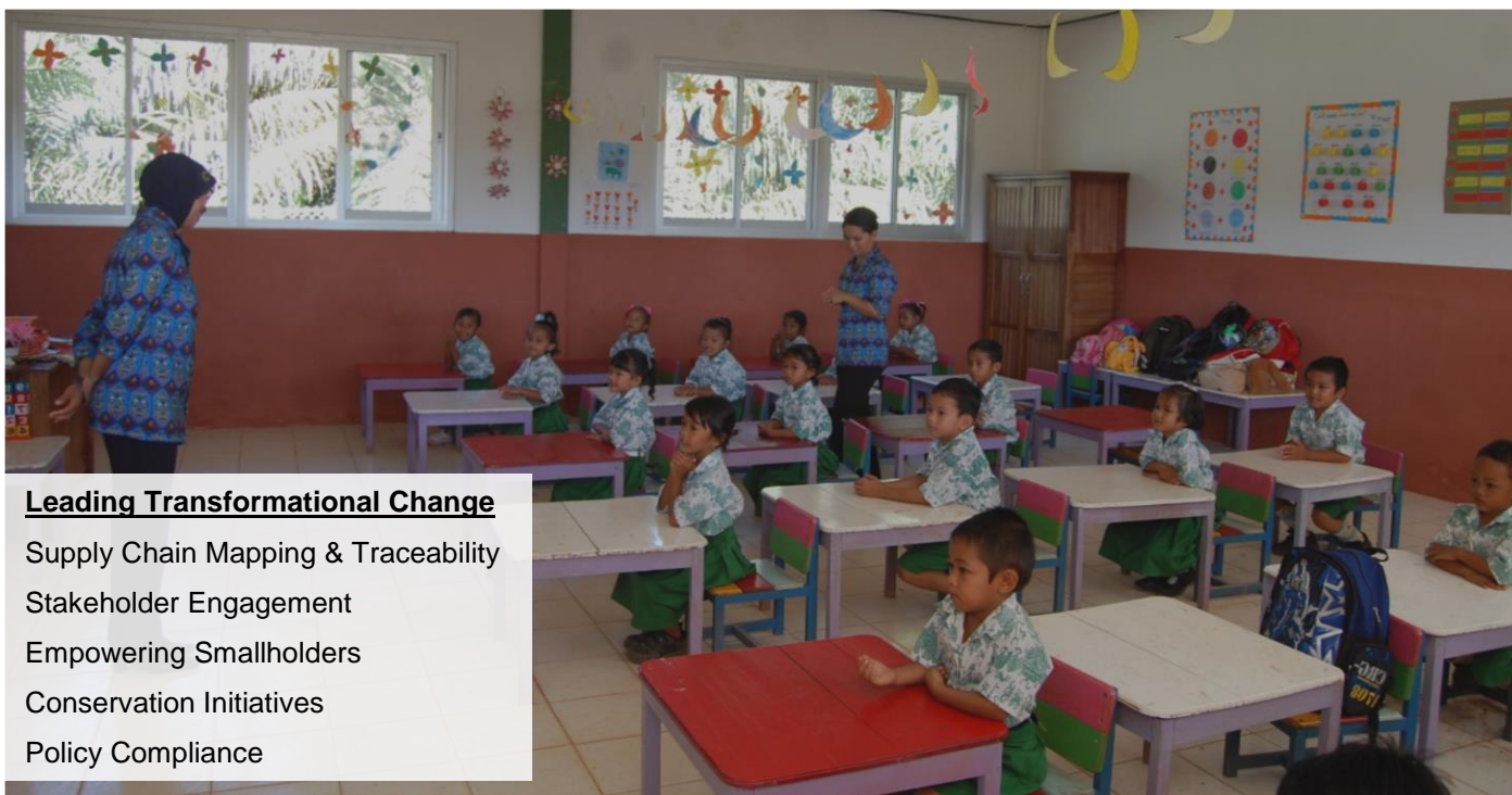
Kindergarten class in Wilmar's estate in Indonesia