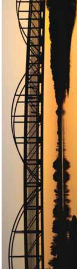
BRIDGELAND, HOUSTON, TX

The Woodlands is in high performance mode, and it is incumbent on us to deliver as much value as possible from this asset during this period of its life cycle. In summary, on a "same store" basis, commercial net operating income (including golf membership deposits) has grown from $12.7 million in 2011 to $26.4 million in 2012, a 108% increase. More information on The Woodlands can be found at www.thewoodlands.com .