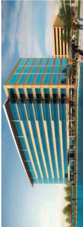
ONE HUGHES LANDING, HOUSTON, TX

In May 2012, we purchased our partner's interest in Millennium Phase I, a 393 unit Class-A multi-family development in the Town Center. We financed this acquisition with a $56 million non-recourse loan at a 3.75% interest rate. The proceeds from this transaction were used to repay the interim construction loan, purchase our partner's interest, and make a $4.1 million distribution to Howard Hughes. Today, Millennium I generates $4.8 million in net operating income. At current market cap rates we estimate that this asset is worth about $30 million more than we paid for it less than one year ago. Contemporaneous with this transaction, we entered into a joint venture with The Dinerstein Companies, our partner on Phase I, to begin the next phase of the development and construct 314 new Class A units. We contributed our land at $75 per square foot, nearly 50% more in per square foot of land value than that of the first phase. Land in The Woodlands is a scarce asset and we are working hard to make sure that we receive fair value as we sell off our remaining parcels.