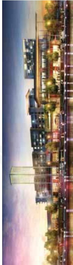
RESTAURANT ROW AT HUGHES LANDING, HOUSTON, TX

Recently, we announced the redevelopment of The Woodlands Resort & Conference Center. We are financing this project with a three-year $95 million construction loan at LIBOR plus 350 basis points. This loan repays the existing $36 million facility set to mature this year and provides capital for our redevelopment. The resort generated $10.7 million in net operating income for 2012, $6.3 million more than in 2010. The redevelopment will encompass the renovation of 222 existing guest rooms; the replacement of the 206 room Lodge with a new wing consisting of 184 guest rooms and suites, a new, expanded arrival area with a porte-cochere and lobby featuring native Texas stone, massive, three-story windows; a new 3,036 square-foot "Living Room" connecting the three guest room wings, ideal for informal gatherings; a new 1,000-foot long Lazy River winding through a tree-lined outdoor area, renovation of the entire meeting and event facilities, including the ballroom, boardrooms and breakout space; an updated 13,000 square-foot spa and fitness facility; and a new 120-seat prime steak house restaurant and lounge adjacent to the 18th hole. This redevelopment will solidify the property's position as the premier resort and conference center in Texas and meet burgeoning demand from corporate clients.