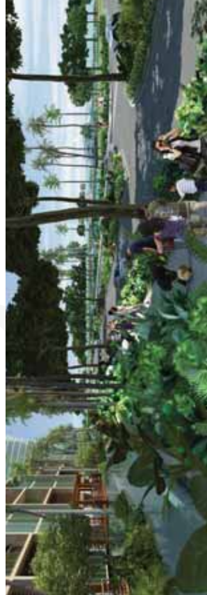
WARD VILLAGE, HONOLULU, HI

The strong response at ONE Ala Moana is good news for Ward Village, one of the company's key value creation opportunities. In its current state, Ward Village generates approximately $23 million of annual net