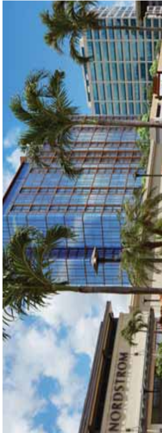
ONE ALA MOANA, HONOLULU, HI

This project represents a strategically important development opportunity for the company and a catalyst for increases in residential land sale pricing and velocity. We estimate, based on current market conditions, that the opening of The Shops at Summerlin will lead to an increase of $100 million of additional revenue from residential land sales. In the coming years, thousands of residents in apartments and condominiums will live in the heart of Downtown Summerlin. In addition, office buildings will be constructed to meet the demands of companies wanting to enjoy this world class community where their employees can “live, work, play and learn”.