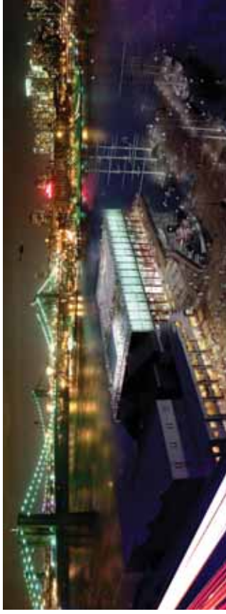
SOUTH STREET SEAPORT, NEW YORK, NY

Occasionally, I have been asked whether or not the company intends to acquire other companies and/or assets outside of the existing portfolio. Because we have so many opportunities to invest capital at high rates of return in the existing portfolio, the standard for new acquisitions is extraordinarily high. The opportunity set within our existing portfolio is exceptionally attractive. Our investment in One Hughes Landing is a good example. By contributing our land to the development, we were able to raise non-recourse construction financing of $38 million, limiting our cash equity investment to $9 million. Using market values for our land contribution, we are projecting a 10.3% return on cost at completion, more than 300 basis points above market cap rates. Because of the limited equity required and the high projected returns, we anticipate that