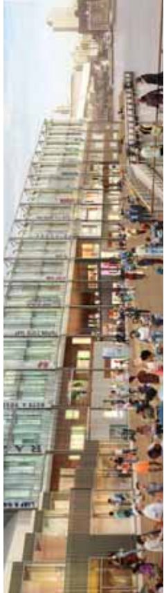
SOUTH STREET SEAPORT, NEW YORK, NY

The majority of our value creation potential resides in a handful of core assets: South Street Seaport, in Lower Manhattan, the master-planned communities in Columbia, Maryland, The Woodlands and Bridgeland in Houston, Texas, and Summerlin in Las Vegas, Nevada. The Shops at Summerlin, and Ward Village, an urban master-planned community in Honolulu, Hawaii. We are focusing our resources on these core assets while repositioning the remaining assets of the portfolio in order to maximize their value for potential disposition or other forms of monetization.