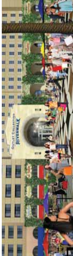
THE OUTLET COLLECTION AT RIVERWALK, NEW ORLEANS, LA