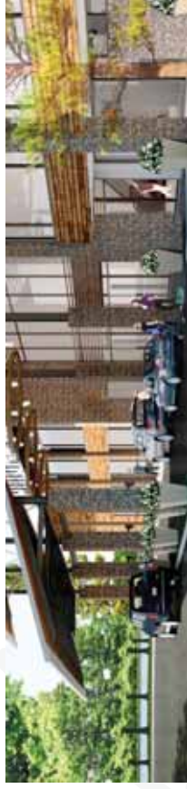
THE WOODLANDS RESORT, HOUSTON, TX

In my 2011 letter to shareholders, I described the value proposition of The Woodlands investment. Based on the most recent transactions, I believe that the estimated proceeds from residential land sales in that letter were understated. During the second half of 2012, we conducted an auction of 375 lots comprising seven different lot sizes and invited nine additional home builders who were not already building homes in The Woodlands to participate. This auction was extremely successful, resulting in an overall 49% price increase over the previous sale prices for comparable lots. Applying the realized increase in pricing across 3,125 lots (2,750 at the end of 2012 plus the 375 in the auction) results in $196 million of incremental proceeds above our previous forecasts. This assumes we are only able to obtain the same premium for all of our remaining lots. I believe residential land prices at The Woodlands have room to increase substantially given the demand for lots, their scarcity, and the growing commercial base within the Town Center.