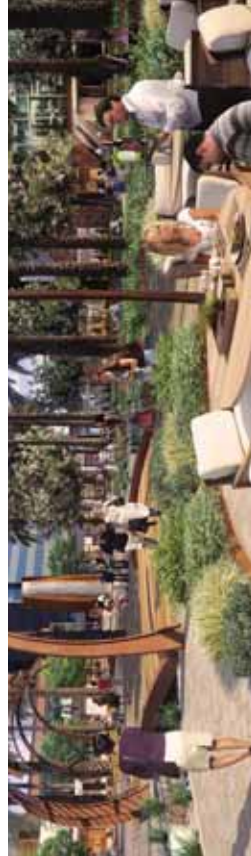
THE SHOPS AT SUMMERLIN, LAS VEGAS, NV

In August, we successfully acquired 70 Corporate Center, a 169,000 square foot office building that was 26% occupied. We simultaneously executed a lease to relocate Enterprise Business Partners to this building which will bring occupancy to 71% by March of this year. The acquisition was financed with 100% of the cost provided by the previous lender on the site. We expect to invest $7 million of equity into this development for renovations and re-tenanting. At stabilization, we expect our investment will deliver an estimated 28% cash-on-cash return. 70 Corporate Center is at the gateway to The Crescent area, a 40-acre parcel that will contain the majority of our future development in Columbia. Visit this development at www.columbiamd.com