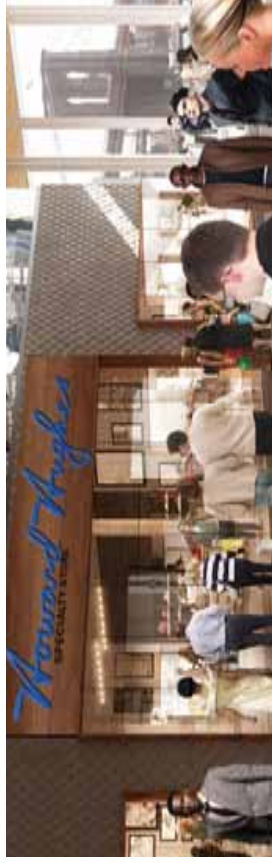
SOUTH STREET SEAPORT, NEW YORK, NY

In the same way that buyers pay substantial premiums to live in Summerlin or The Woodlands, by delivering a comprehensive master planned community environment that no other competitor can deliver, we expect Ward Village to capture similar premiums and generate substantial value over the life of the project not only for our shareholders, but also for the new residents. I encourage each of you to follow our progress by visiting our website www.avisionforward.com .