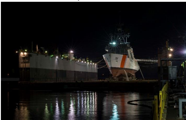
Photo of NSC-6 Munro.