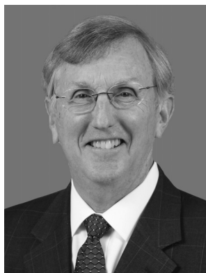
R. David Yost