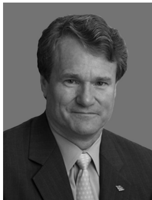
Brian T. Moynihan