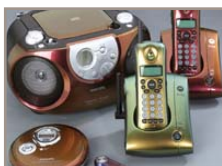
Decorative and Product Differentiation