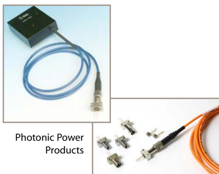
Photonic Power Products