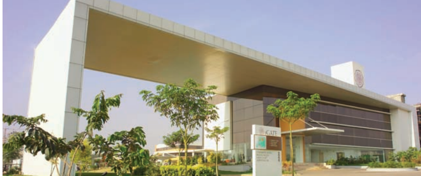
iGATE's Bangalore Campus

We firmly believe that the Information Technology and Business Process Outsourcing industry in India is in its infancy, and that significant revenue and profit growth opportunities remain ahead of us. The global market for IT services and business process outsourcing is estimated to be nearly $300 billion. McKinsey & Company and NASSCOM (The National Association of Software and Services Companies, an Indian industry group) have estimated that just 10% of the global market for the types of IT and business services we offer has been tapped.