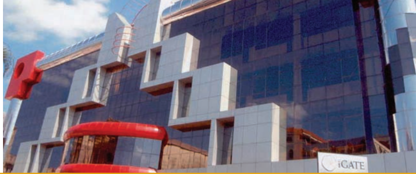
iGATE's Hyderabad Center