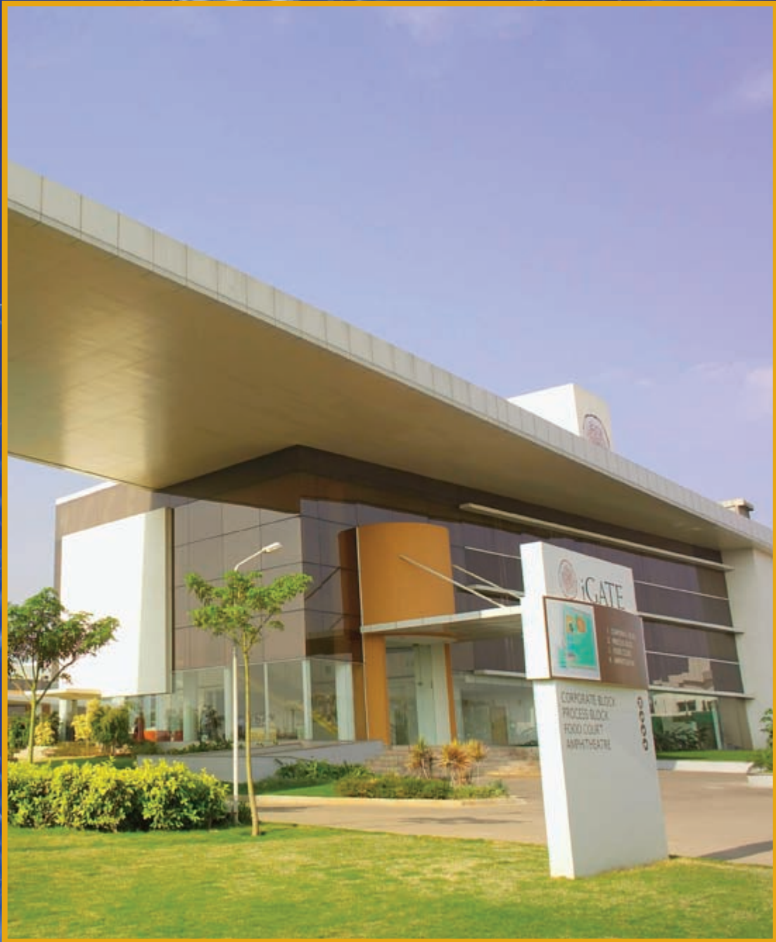
iGATE's Corporate Block building at it's Whitefield Bangalore campus.