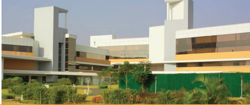
iGATE's Bangalore Campus

During the year, we made a successful and fundamental shift in our business strategy to target multi-year offshore projects with large companies that offer strong growth opportunities. Many of these larger companies that have been added to our client base during the past 12 months have contributed meaningfully to our recent revenue growth, yet possess significant untapped project expansion opportunities. We anticipate that these clients will contribute significantly to our future revenue and profit growth.