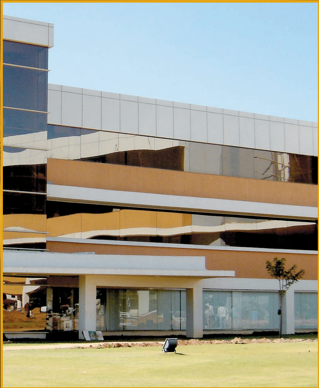
One of iGATE's newly completed Process Block buildings at it's Whitefield Bangalore campus.