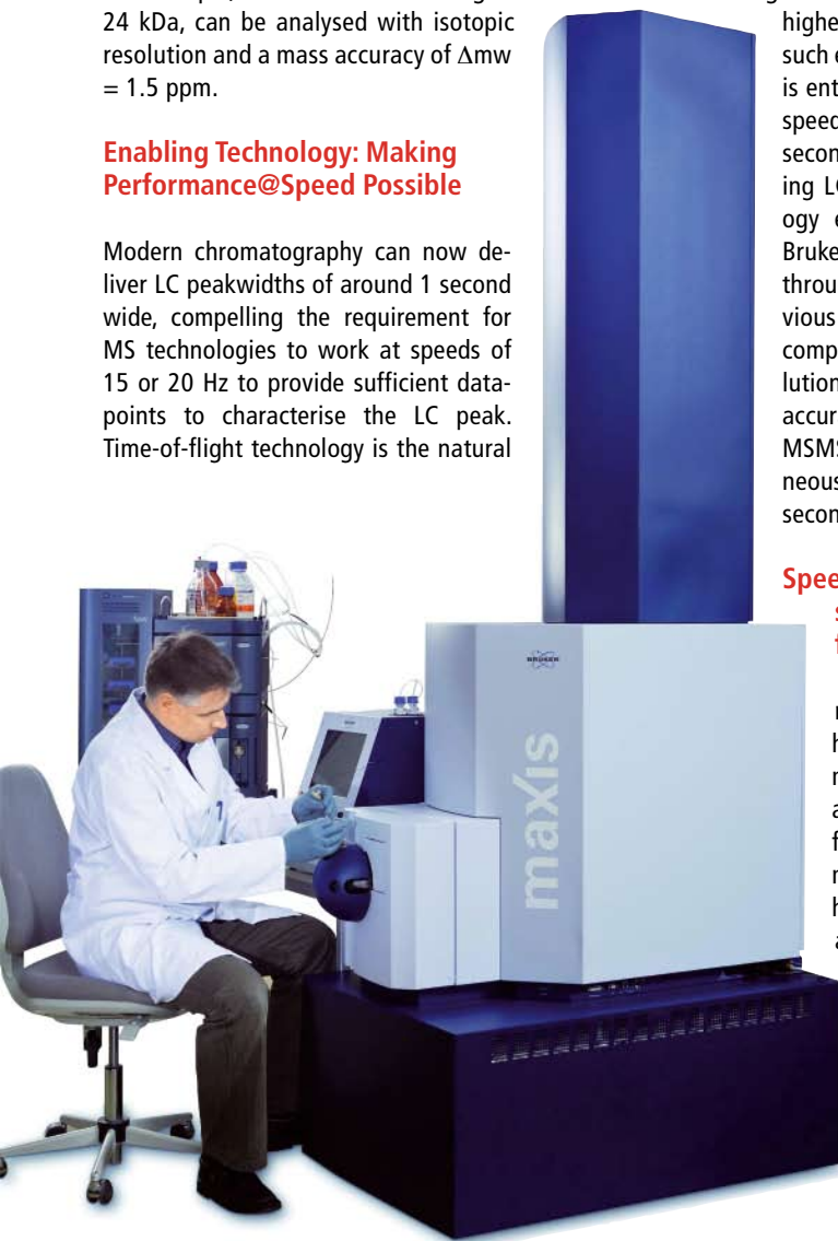
Fig. 3: The maXis supports a wide variety of different HPLC and sample inlet systems.