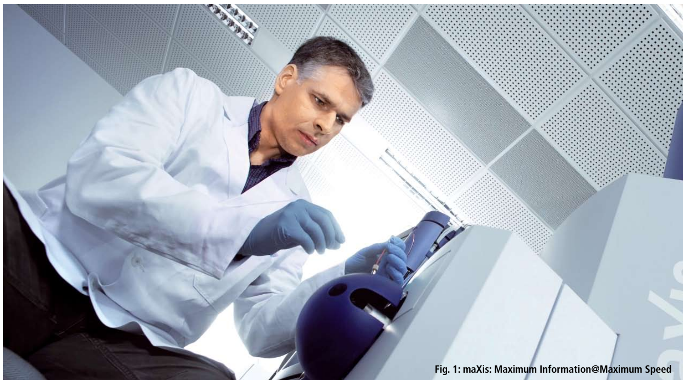
Fig. 1: maXis: Maximum Information@Maximum Speed