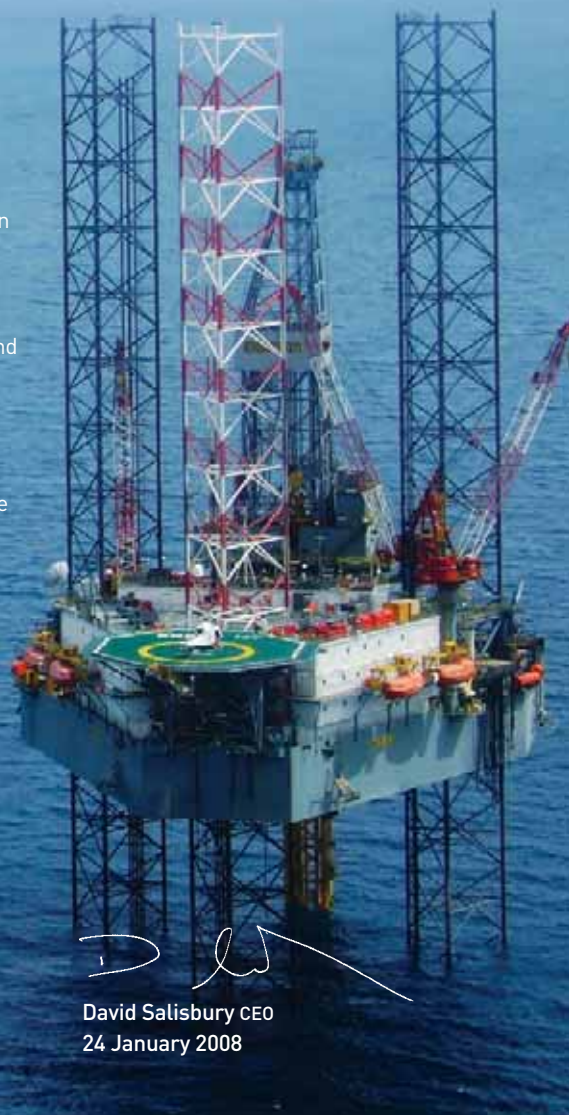
David Salisbury CEO 24 January 2008

In 2007 NZOG was the 6th best performing stock in the NZX Top 50. Strong revenues from Tui, along with significant progress with Kupe and Pike, sets NZOG up for a very successful 2008.