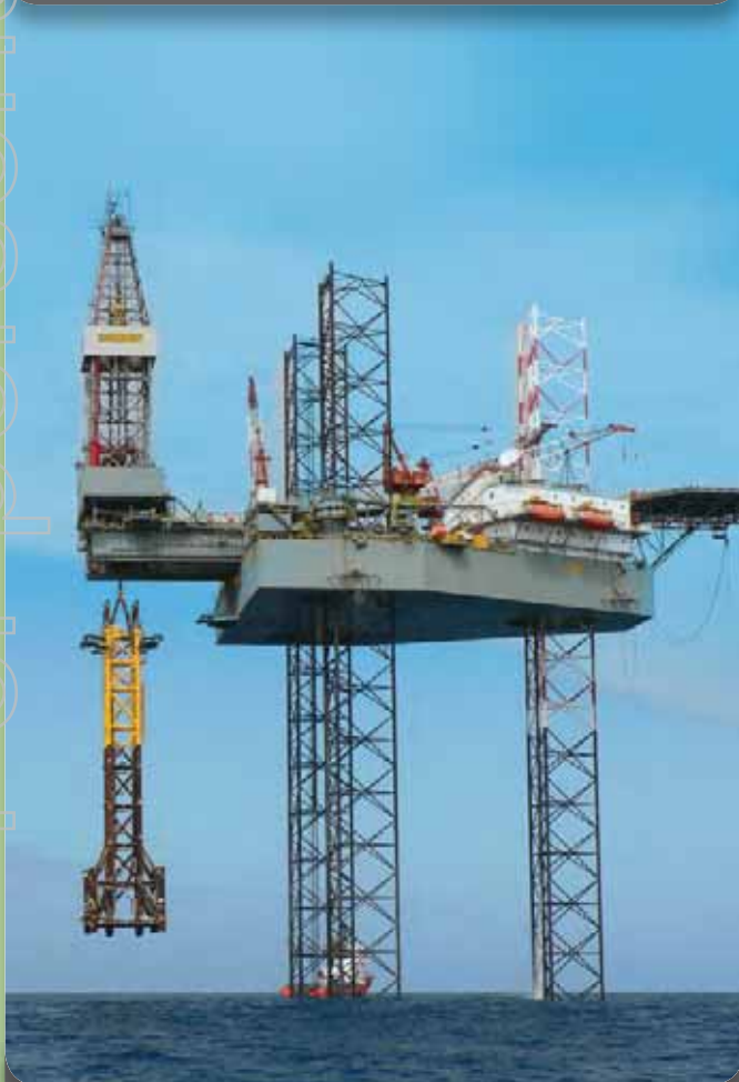
Ensco-107 drilling rig installing the Kupe production platform

In January, PRC announced a $60 million rights issue to shareholders and optionholders and a US$30 million convertible bond facility to Liberty Harbor. NZOG supports this move to secure funding for the mine and is underwriting its $17.5 million share of the rights issue.