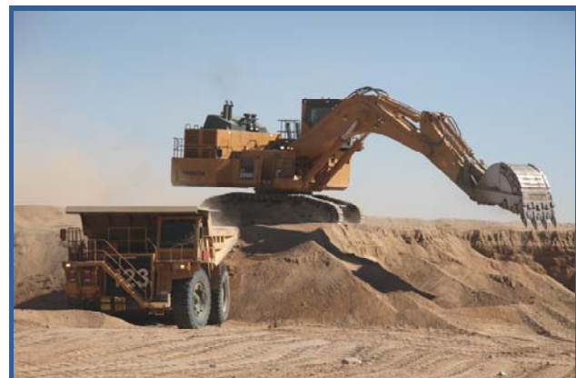
MINING AND LOADING