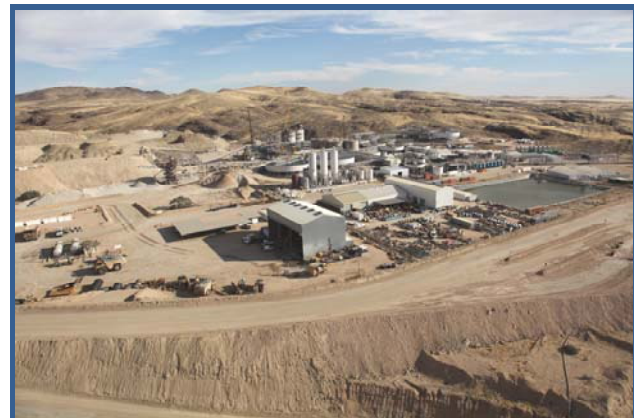
OVERALL PLANT VIEW