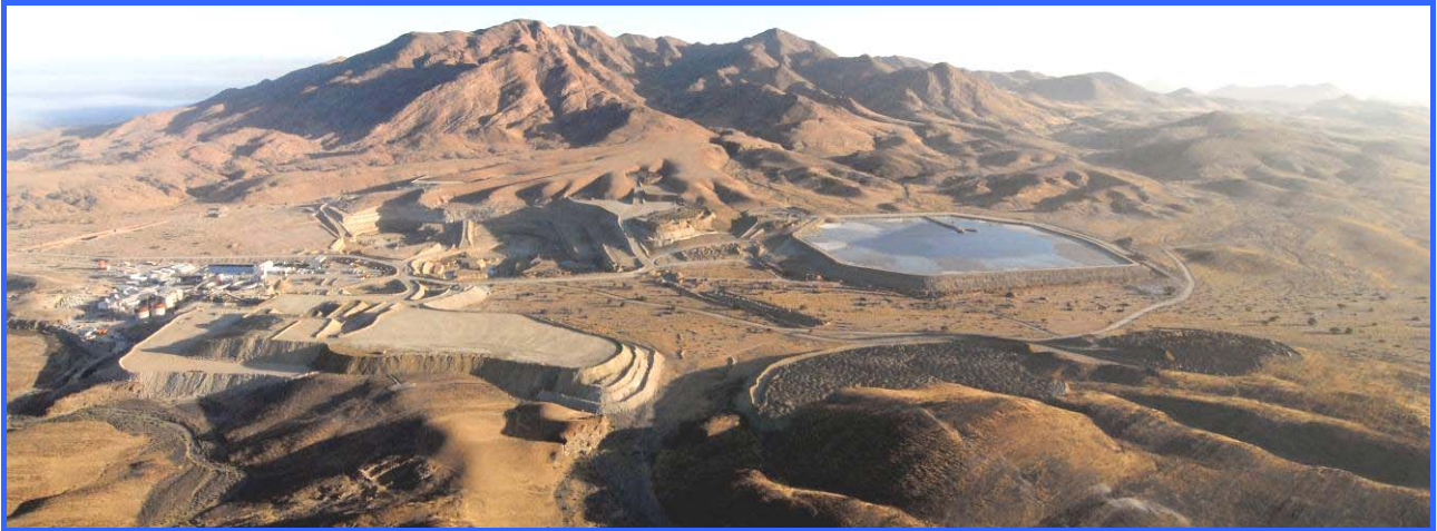
AERIAL VIEW OF MINE SITE