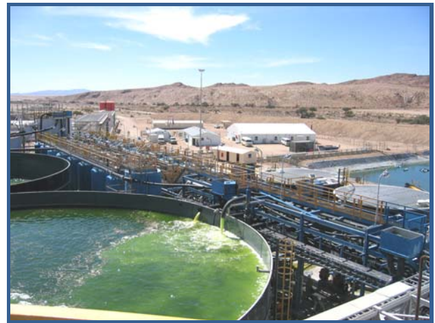
IX CIRCUIT AND SOLUTION STORAGE TANKS

The relevant long term price indicator has exhibited less volatility during the recent downturn, moving from US$70/lb U_3O_8 in January 2009 down to US$62/lb U_3O_8 by December 2009 and is now US$58/lb U_3O_8 .