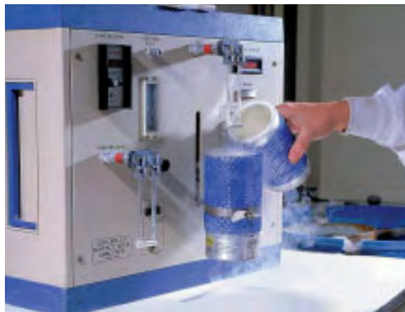
This Automatic Surface Area Analyzer is used in our zinc quality control process.

Use of zinc is growing in a wide range of industries as manufacturers and consumers demand greater content of zinc-protected steel in categories such as durable goods and building products.