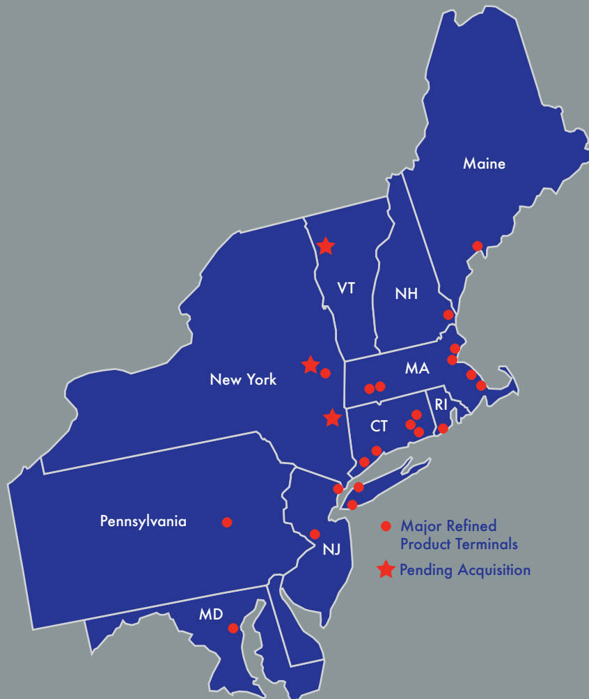
Quarterly Cash Distribution