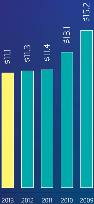
TOTAL REVENUES* (In billions)