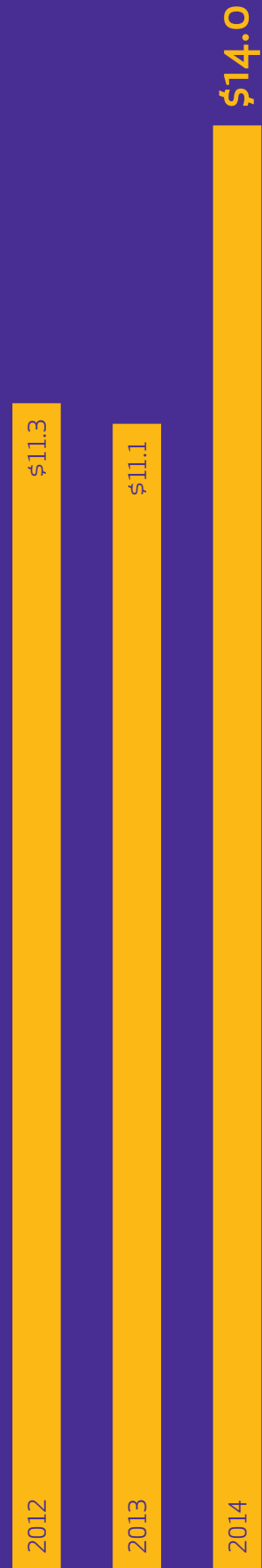
TOTAL REVENUES (In billions)