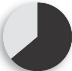
Sales Tonnes by Segment

We conduct our business through wholly and majority-owned subsidiaries as well as businesses in which we own less than a majority or a non-controlling interest. We are organized into two reportable business segments: Phosphates and Potash. The following chart shows the respective contributions to fiscal 2012 sales volumes, net sales and operating earnings for each of these business segments: