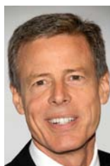
JEFF BEWKES, CHAIRMAN AND CEO, TIME WARNER INC.

On February 4, 2009, Time Warner Inc. reported financial results for its full year and fourth quarter ended December 31, 2008. Commenting on the results, Time Warner's Chairman and Chief Executive Officer Jeff Bewkes said: "We're making progress at Time Warner toward our goals of becoming a more content-focused company and delivering increasing returns to our stockholders. Last year, our priorities were to rationalize our structure and improve our operating performance. Despite the challenging economic environment, we achieved most of what we set out to do. Moving into 2009, we intend to build on these accomplishments. Operationally, we'll continue to improve the efficiency of our businesses while creating even more of the compelling content that's becoming increasingly valuable. Structurally, we'll complete the Time Warner Cable separation soon. At the same time, we'll strengthen our balance sheet, improve our strategic flexibility and return capital to our stockholders on a consistent basis. Through these steps, we expect to emerge from this downturn in an even stronger competitive position."