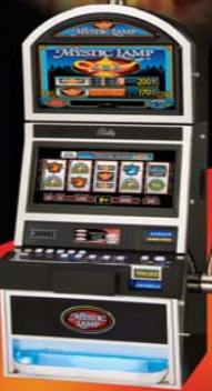
ALPHA Elite™ SgE