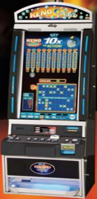
ALPHA Elite™ V32