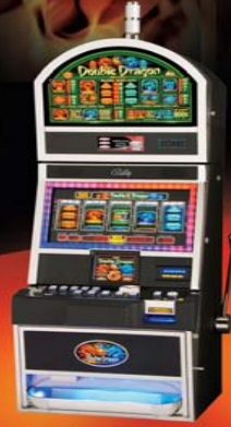
ALPHA Elite™ SgC