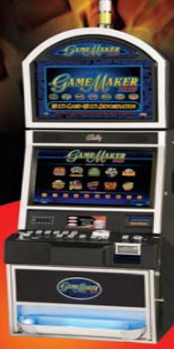
ALPHA Elite™ V20/20