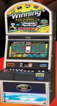
ALPHA Elite™ V20