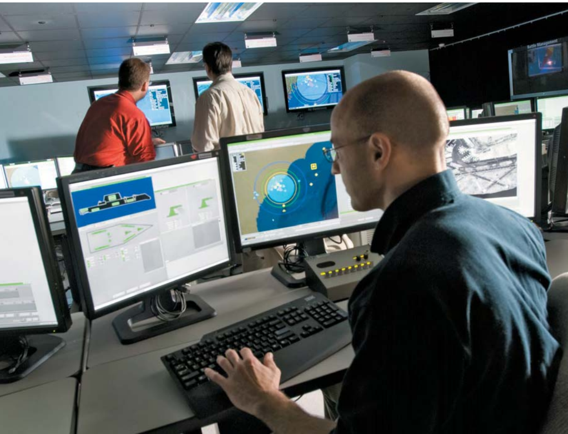
Ship mission center at the Seapower Capability Center