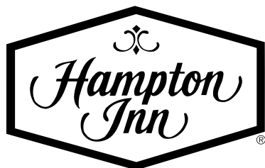
One Color - Positive Copy