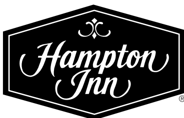
One Color - Reverse Copy