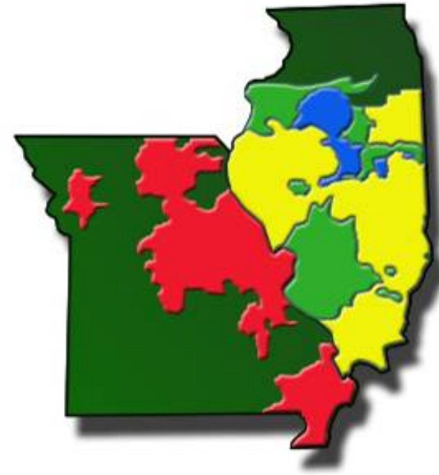
Ameren Service Territory