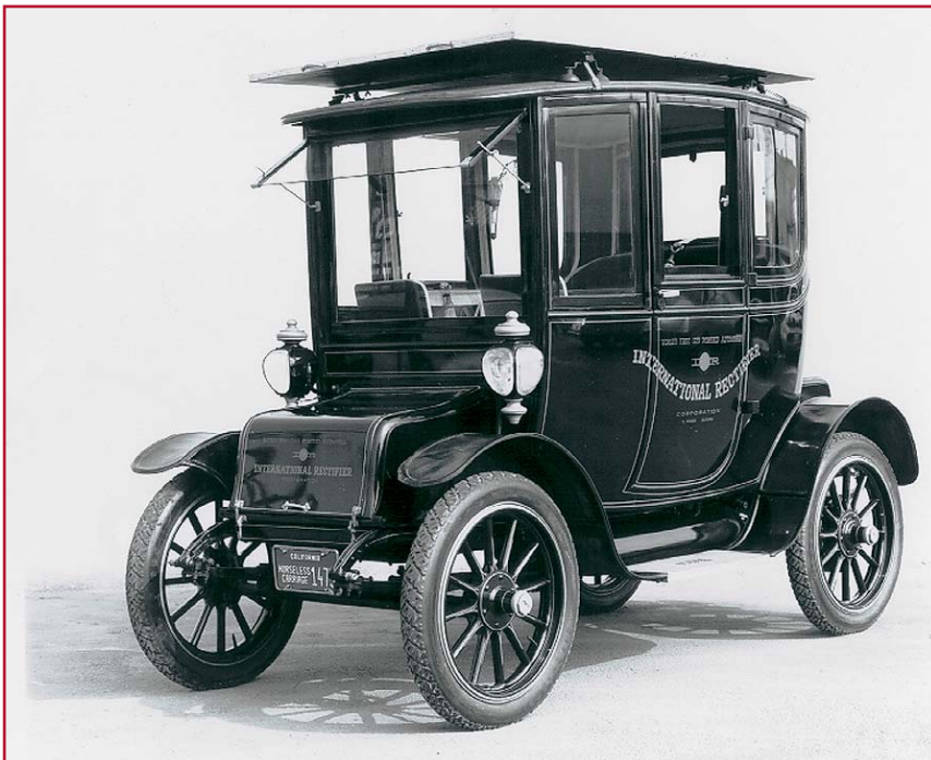
■ IR Solar King: Based on the Baker 1912, Eric Lidow developed the first solar-driven electric vehicle. The arrangeable solar panel hosted 10,640 solar cells.

Approximately 39 million air-conditioning systems and some 80 million refrigerators are being sold every year. For all these appliances, 60% of the energy consumed could be saved by using speed-controlled engines. For the 69 million washing machines sold in the same period, the savings potential is 64%. In the aggregate, the resulting savings amount to $14.5bn in cash each year. Alexander Lidow: „For energy-efficient power electronics, vast opportunities are being offered by energy-saving drive control architectures. However, as the complexity of motor drive development is continuously increasing and as thousands and thousands of highly specialized skills are required to blend control algorithms with the development of analog circuits and power management,