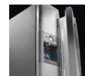
Stainless Formed Door Refrigerator Refrigerator with sculpted formed door, and attractive, easy-to-clean flush-to-the-door ice and water dispenser and LCD controls. NA