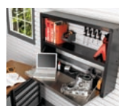
Gladiator Fold-Away Workstation Durable and solid work surface for all kinds of garage projects. NA