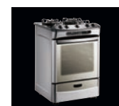
Unique Glass Range High-end range with a gas on glass cooktop for easier cleanliness. LA