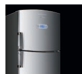
Gourmand Refrigerator Refrigerator for the amateur gourmet consumer with exclusive stainless-steel design and cheese, desserts, and quick-chill beverage compartments. LA