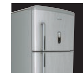
Iceberg Refrigerator Contemporary styling with uniform cooling and Fast Ice making, complimented by LED illuminated interior and intelligent electronics. A