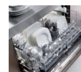
Wide Built-in Dishwasher 90cm (35 inch) wide dishwasher offers improved ergonomics. E