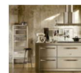
European Launch of KitchenAid KitchenAid major appliances launch in Europe. E