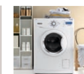
Bluetouch Washer Washes large loads with "smart" technology that saves up to 30 percent more water and energy. E