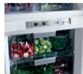
Built-in No-Frost Refrigerator Built-in "no frost" refrigerator with improved cold air circulation and an anti-bacterial device to keep food fresher longer. E