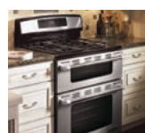
All-Gas Double Oven First all-gas double oven. NA