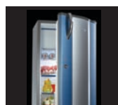
Fusion Direct-Cool Refrigerator Provides more than 17 hours of cooling retention during power outages, compared to other refrigerators that offer only six hours. A