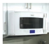
Velas Speedcook Oven High-speed microwave-hood combo with improved venting, increased capacity and four cooking methods: convection, speedcook, microwave and steam. NA, E