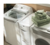
Cabrio Laundry Pair Large capacity laundry pair has a see-through window in the washer and the dryer. NA