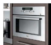
Twin Genius Speedoven Compact built-in speedcook appliance provides four cooking methods: oven, convection, speedcook and microwave. E