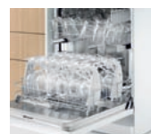
Party Program Accessory that provides excellent dishwasher cleaning and maximum care for a full load of glasses. E