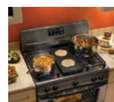
Freestanding Hispanic Gas Range Range with bilingual controls and interchangeable full-width grate that accommodates a tortilla griddle, adapted for the U.S. market. NA