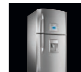
Aesthetic Refrigerator New aesthetics and features include formed door, and external water dispenser and controls. NA