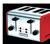
Metal Toaster Multiple color choices accent brushed stainless steel finish; sides of toaster stay cooler. NA