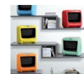
Max Microwaves New Max product line offers new colors to match kitchen décor. E