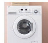
Eco-Friendly Washer Reduces energy use and offers a "Start Delay" function for overnight washing. E