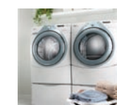
Duet HT Laundry Pair New, sleek design with larger door, more intuitive controls and outstanding energy efficiency. NA