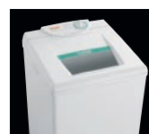
Semi-automatic Washer Entry-level washer with enhanced features and lower pricing. LA

Unique, innovation features designed to update existing products and present new product attributes to the marketplace.