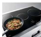
Glass Cooktop Line Premium induction and vitreoceramic built-in cooktop line. E