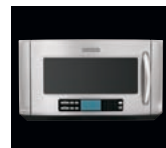
30" inch Speedcook Appliance 30" microwave-hood combo, with true capture ventilation, matches the performance and styling of its counterpart commercial-level cook surface. NA