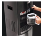
Water Coolers Water coolers with built-in LCD display and adjustable temperature. NA