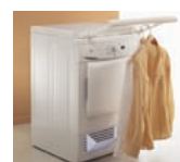
Gentle Drying Accessory Condenser dryer with space-saving accessory to dry delicate fabrics. E