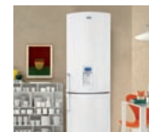
Bottom-Freezer Refrigerator with Filtered Water Bottom-freezer refrigerator with filtered water dispenser that does not compromise the space inside the refrigerator. E