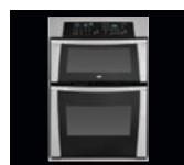
SpeedCook Built-in Combination Oven Achieves uniform cooking results 30 percent faster than traditional oven with convection cooking in lower oven. SpeedCook upper oven grills and bakes. NA