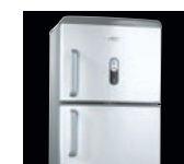
Fresh Refrigerator Promotes fresh food storage with twin cooling towers and antibacterial vegetable crisper. A