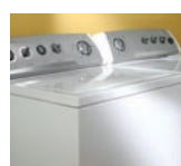
Classic Laundry Pair Top-loading configuration with new styling and reliable fabric care. NA