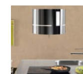
Evolution Hood An exceptionally stylish hood ventilation system that integrates with home interior design. E