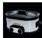
Slow Cooker Electronic temperature sensor allows for quick heating; insulated walls provide more even heat retention. NA