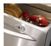
Single Drawer Dishwasher Water and energy efficient, small-load capacity drawer dishwasher with improved ergonomic loading. NA