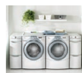
Laundry Work Surface and Tower Organizer Unique staging platform for sorting, treating and folding clothes on top of the dryer. Towers organize laundry supplies. NA