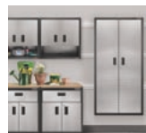
Gladiator Ready-to-Assemble Series Ready-to-assemble series of cabinets for a do-it-yourself garage storage system. NA