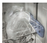
Power Cleaning Dishwasher Targeted spray jets scour away baked-on foods with low sound levels in dishwashers across brands. NA, E (2007)