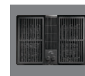
Outdoor Collection Revamped styling and new features, including warming drawers, built-in trash and utility drawers, and electric downdraft grills. NA