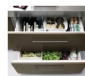
Refrigerated Double Drawers Built-in modular refrigerator and wine coolers that reflect the latest trends in horizontal architecture. E