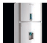
Pure-Water Dispensing Refrigerator Refrigerator with exclusive water purification system. Intelligent electronics advise consumers when to replace the filter. LA