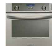
Built-In SuperHeated Steam Oven Built-in oven that combines steam with convection cooking. NA, E