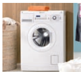
Hygiene+ Washer Unique antibacterial treatment cycle heats laundry to destroy bacteria and remove allergens. E