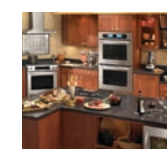
Architect Series II Suite of Products Complete top-of-the-line collection with best-in-class performance, including induction cooktops, warming drawers, built-in refrigerators and a first-of-its kind, full-size wall oven. NA