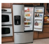
French Door Bottom-Freezer Refrigerator with Ice and Water Dispenser The first French door bottom-freezer refrigerator with ice and water on the door. NA