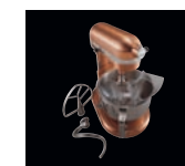
Stand Mixer with 11 Wire Whip Super-premium stand mixer features an 11 wire whip and new all stainless-steel hook and beater. NA