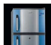
Delight Frost-Free Refrigerator Refrigerator with LED illumination and storage pedestals for non-perishable food, available in multiple finishes and colors. A