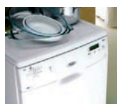
6th Sense Dishwasher Provides variable water pressure and its overnight cycle is amazingly quiet. E