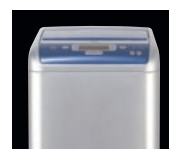
Washer Lid Colors New color accents on washer can match décor of laundry area. A