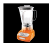
Blender Professional-grade polycarbonate pitcher and patented blade system with Intelli-Speed for fast and consistent blending. NA