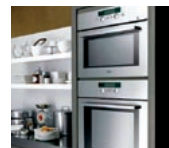
European Oven Line Premium built-in oven line with fingerprint-proof finish and SmartCook programming for pre-set recipes and functions. E