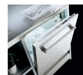
Super-Silent Overnight Dishwasher Overnight wash program is super silent due to the internal water pressure system regulator. E