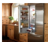
42" French Door Built-In Refrigerator The world's first 42-inch built-in French door bottom-freezer refrigerator provides the widest refrigeration space available. NA