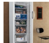
Refrigerator with Space Saving Drawers Multiple hygienic drawers offer better space management and optimum food storage. E