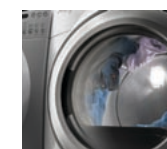
Steam Dryer Steam dryer relaxes wrinkles and removes odors in minutes. NA