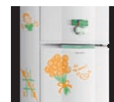
Draw and Erase Refrigerator Allows consumers to draw and erase on the door's surface without impacting quality or aesthetics. NA, LA