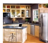
Kitchen Suites Appliances are designed to be sold in suites for one-time shopping. NA