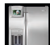
centralpark Connection Refrigerator Refrigerator with an entertainment hub for consumer electronic devices such as digital picture frames and MP3 players. NA