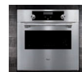
6th Sense Built-in Oven Oven "senses" the weight of food and the precise temperature inside the cavity to control the cooking process and adapt cooking time. E