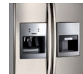
Refrigerator with Built-In Espresso Maker First side-by-side refrigerator with built-in espresso coffee machine. E