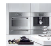
In Line Gallery Collection Compact products offer traditional and innovative functions - microwave cooking, fully automatic coffee machine and warming drawer, all with the same aesthetics. E