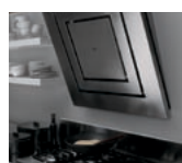
Flat Screen Hood Contemporary, high-tech design combines traditional hood performance with light effects. E