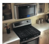
PowerPair Cooking Center Microwave-hood combo and freestanding range with coordinated aesthetics are paired for maximum performance, cooking capacity and efficiency. NA