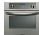
Built-in Multi-Flow Oven Exclusive multi-flow system ensures even air circulation in the cavity for excellent and consistent cooking results. E