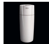
Central Water Filtration System Never replace filter removes chlorine, sediment, taste and odor from every tap in the home. NA