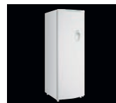
Affordable Refrigerator with Ice and Water Dispenser Refrigerator with ice and water on the door, an aspirational feature for many consumers, yet priced for the entry-level segment. LA