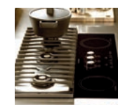
Step Cooktop Premium cooktop that adds two induction plates to the efficiency of three high-performance gas burners. E