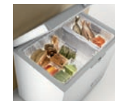
Never Frost Freezer Freezer chest that absorbs humidity and prevents frost built up. E