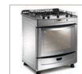
Touch Range First full electronic control for a gas range with more functions and precise control. LA