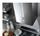
Moonlight Ventilation Hood Ventilation hood with unique integrated light and design elements. E

Completely new product lines created to solve previously unmet consumer needs.