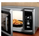
Regional Pre-Programmed Countertop Microwave Mid-size countertop microwave line offers programming for ready-made meals and addresses region-specific consumer needs. E, A, LA