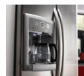
Refresh Refrigerator Maintains quality of food in fresh and ready bins, while the contour door and monochromatic ice and water dispenser provide high-end style in the kitchen. NA