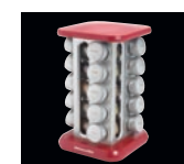
Pantryware Designed to coordinate with KitchenAid appliances, Pantryware items include a canister set, spice rack, paper towel holder and more. NA