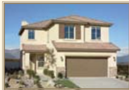
The Cliffstone, Nevada