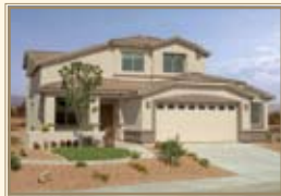
The Terrazzo, Arizona