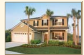
The Waterleaf, Florida