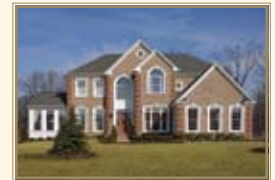
The Providence, Virginia