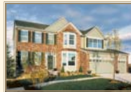
The James, Colorado