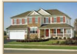
The Oxford, Illinois