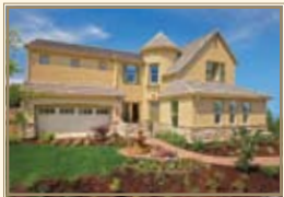
The Diana, California