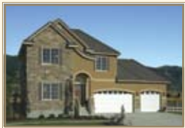
The Avallon, Utah