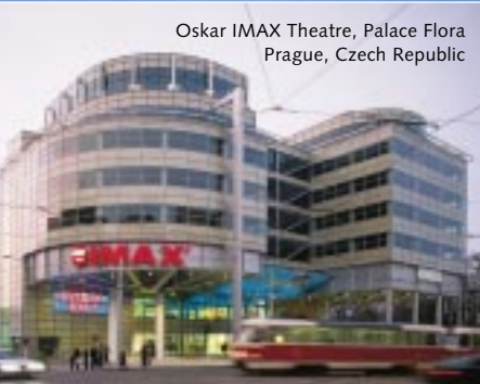
Oskar IMAX Theatre, Palace Flora Prague, Czech Republic