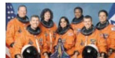
David M. Brown, Rick D. Husband, Laurel Blair Salton Clark, Kalpana Chawla, William C. McCool, Michael P. Anderson, Ilan Ramon