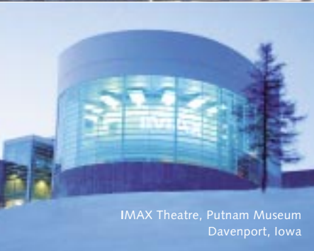
IMAX Theatre, Putnam Museum Davenport, Iowa