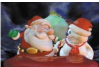
The holiday classic Santa vs. the Snowman premiered in theatres worldwide.