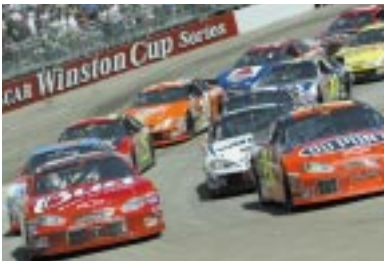
NASCAR The IMAX Experience 3D , currently in production, is scheduled to be released in Spring 2004.