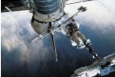
SPACE STATION blasts past $50 million and takes top Giant Screen Theater Association awards for best film, best cinematography and best distribution.