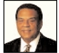
Hon. Andrew J. Young Chairman of the Board, GoodWorks International LLC, former Mayor of Atlanta, former U.S. Ambassador to the United Nations