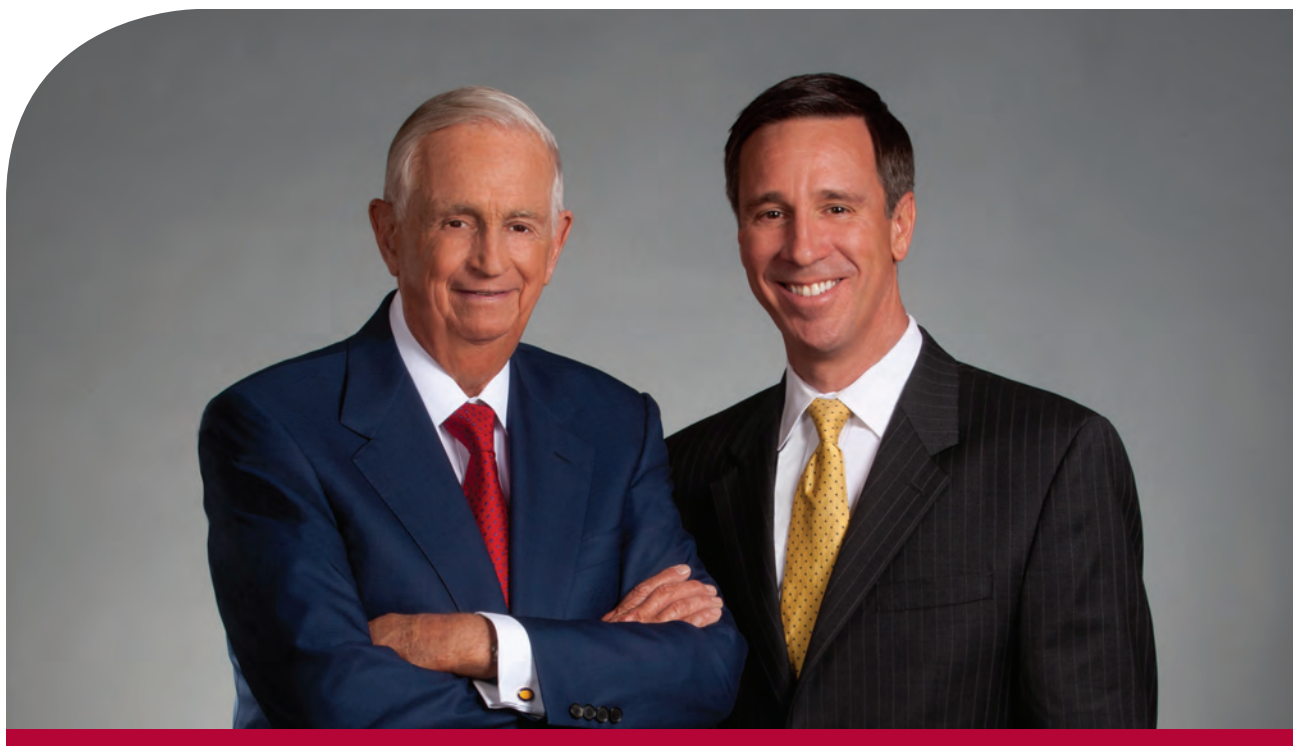
J.W. MARRIOTT, JR. , Executive Chairman and Chairman of the Board ARNE M. SORENSON , President and Chief Executive Officer